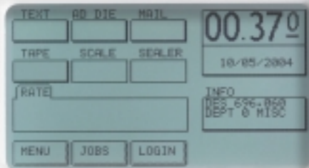
Easy to use large touch screen makes it simple to program repetitive jobs or modify print modes