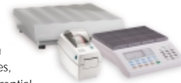
The WJ250 can interface easily with the full line of Hasler scales and weighing platforms, as well as the WJR30 Roll Tape Dispenser.

And you'll also save time with the WJ250, thanks to a number of advanced features, including the option of differential weighing, which allows for easier and faster mail processing at